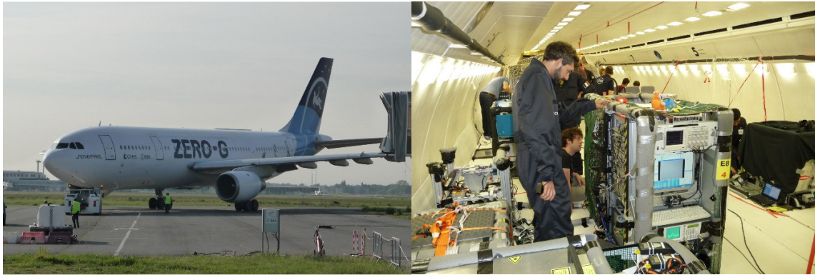
Figure 1: Left: The Zero-G-Airbus. Right: Preparations of the experiment before takeoff.